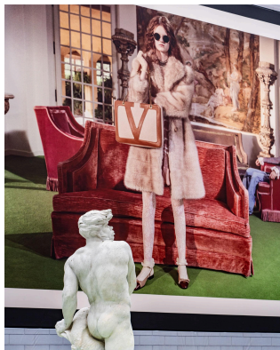
Ben Alper Untitled (from the series Palimpsest) Pigment print 20 x 16 in Edition of 5 2025 $1200 framed / $1000 unframed