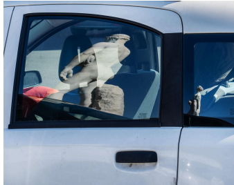
Ben Alper Untitled (from the series Palimpsest) Pigment print 16 x 20 in Edition of 5 2025 $1200 framed / $1000 unframed