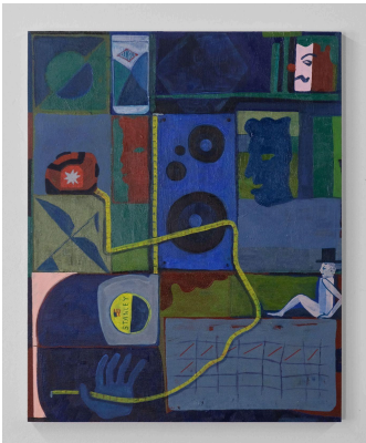
Jerstin Crosby Cut Once Measure Twice 20 x 16 in acrylic and oil on wood panel 2025 $2200