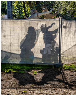
Ben Alper Untitled (from the series Palimpsest) Pigment print 20 x 16 in Edition of 5 2025 $1200 framed / $1000 unframed