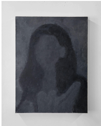
Conner Calhoun He did not believe the body 18.25 x 24 in acrylic on canvas 2024 $1300