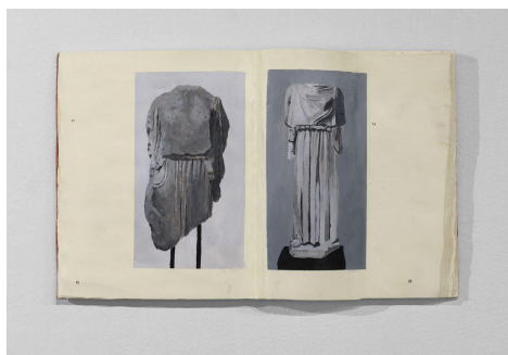
Conner Calhoun I was listening to that Sarah Shook song, you know the one that's about the wrong song coming on, or being as good as gone. Acrylic on carved wood. H- 11 1/8" W- 18" D- 1 3/8" 2024 $1300