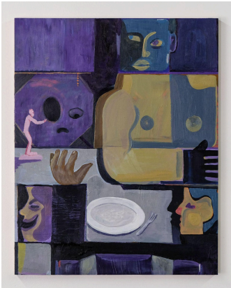
Jerstin Crosby The Dinner Guests 20 x 16 in acrylic on wood panel 2025 $2200