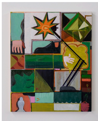
Jerstin Crosby Cut Once Measure Twice 20 x 16 in acrylic and oil on wood panel 2025 $2200